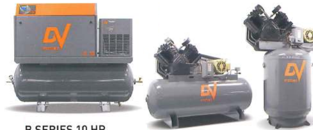
B SERIES 10 HP